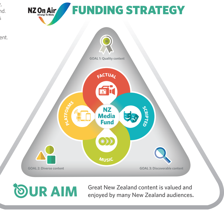
Figure 2: Funding strategy

The NZMF has a single aim: Great New Zealand content is valued and enjoyed by many New Zealand audiences.