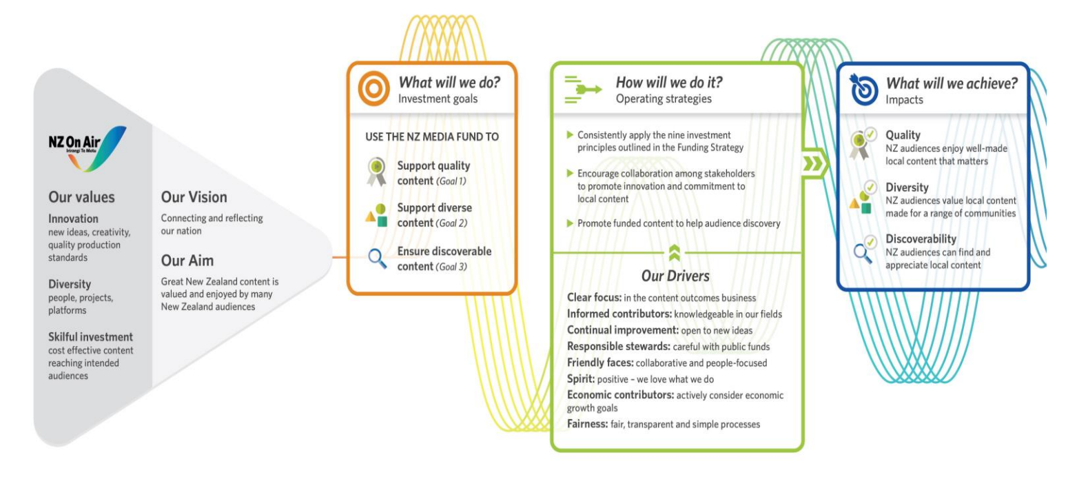
Figure 1: NZ On Air strategy summary

Below is a simple representation of our overarching strategy.