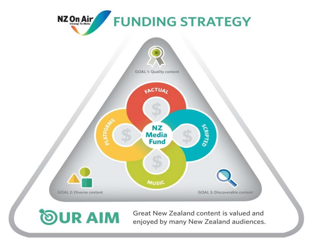
Figure 2: Funding strategy summary

Our funding strategy has three core goals: