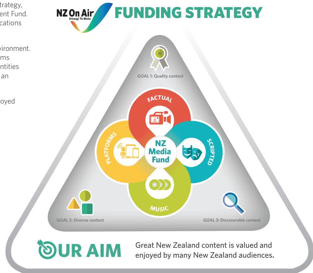
Figure 2: Funding strategy

The NZMF has a single aim: Great New Zealand content is valued and enjoyed by many New Zealand audiences.