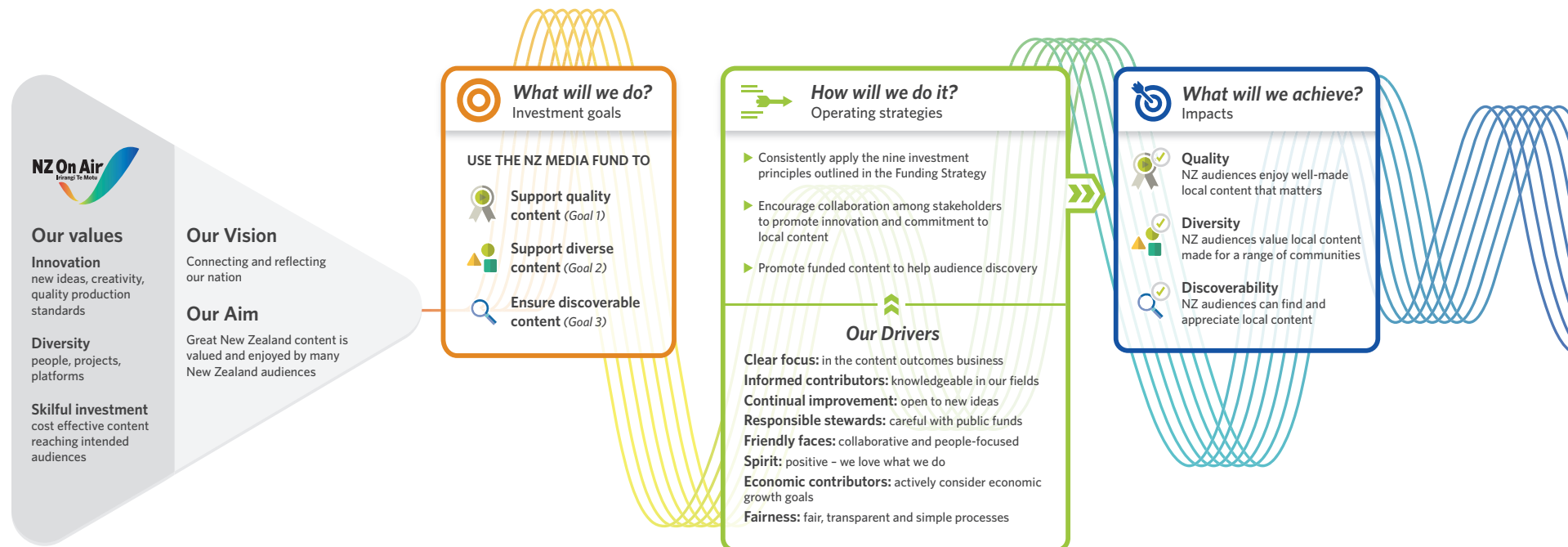
Figure 1: Strategic framework

Our strategic framework shows what drives us and what we are aiming for.